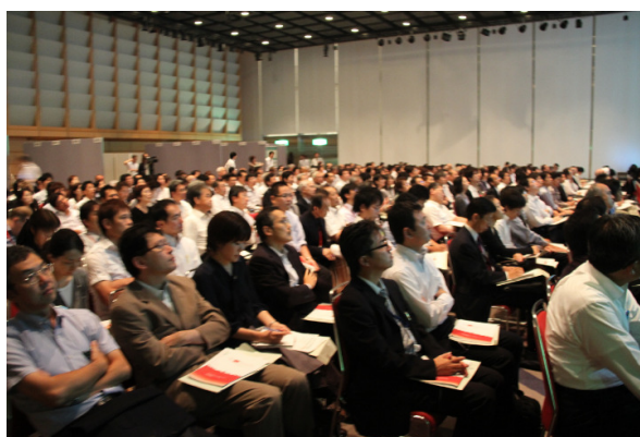
State of the conference