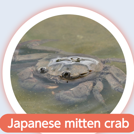
Japanese mitten crab