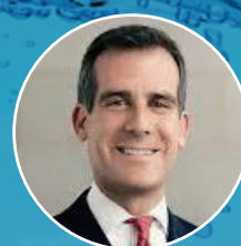
Eric Garcetti Mayor of Los Angeles