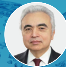
Fatih Birol Executive Director of the International Energy Agency