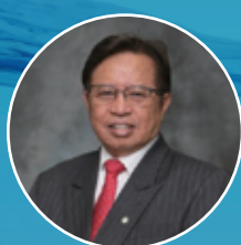
Abang Haji Abdul Rahman Zohari bin Tun Datuk Abang Haji Openg Premier of Sarawak, Malaysia