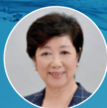
Yuriko Koike Governor of Tokyo