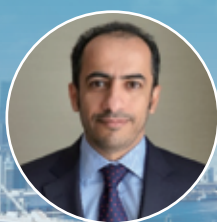
Shihab Ahmed Alfaheem Ambassador Extraordinary & Plenipotentiary of the United Arab Emirates