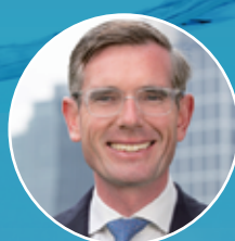
Dominic Perrottet Premier of New South Wales, Australia